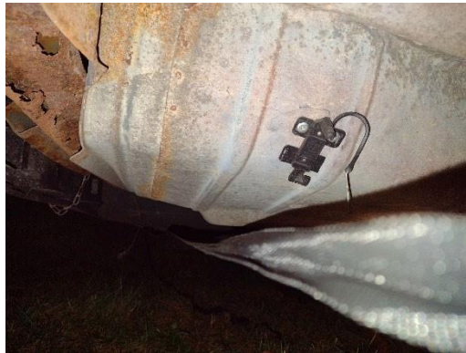
Transponders Available at the track for rent.